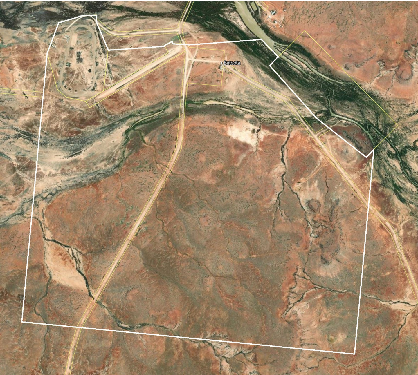
Betoota – Map 2