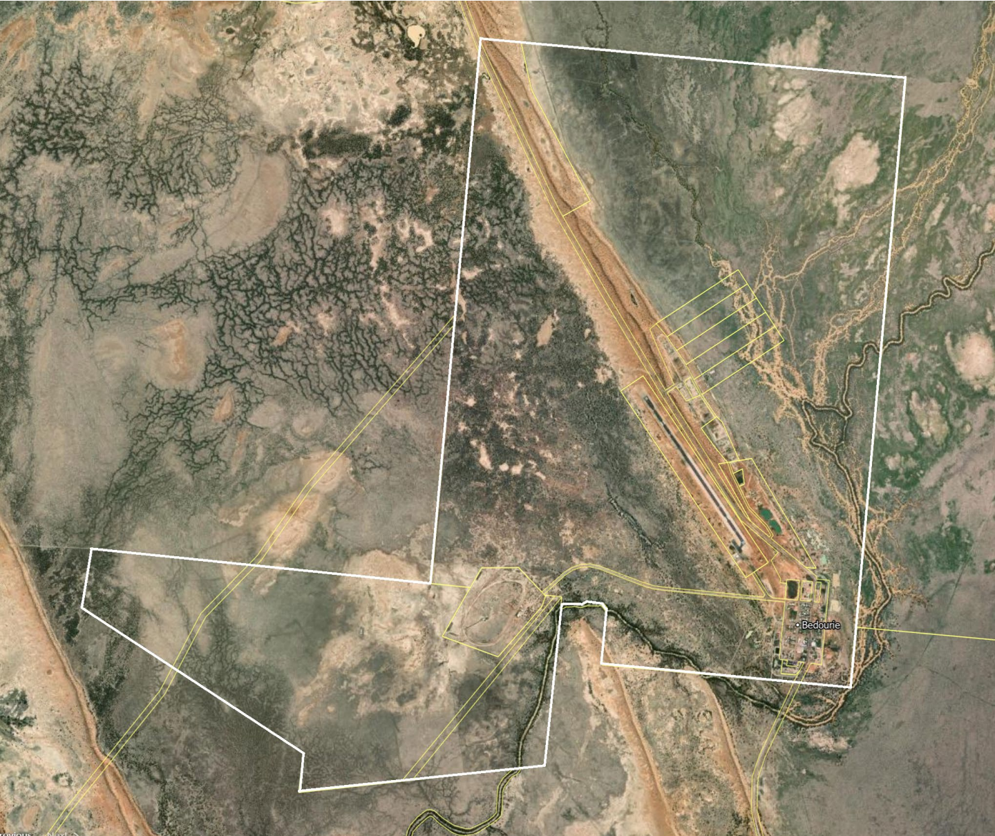
Bedourie – Map 1