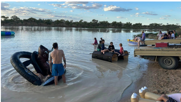
Raft Race Ready!