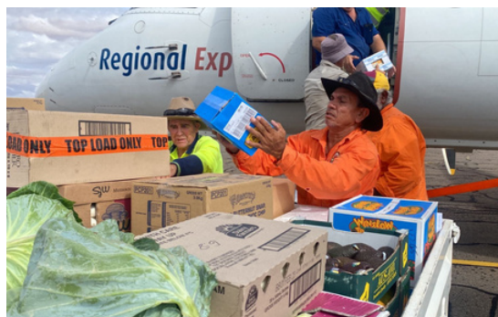
Great team effort loading in Boulia