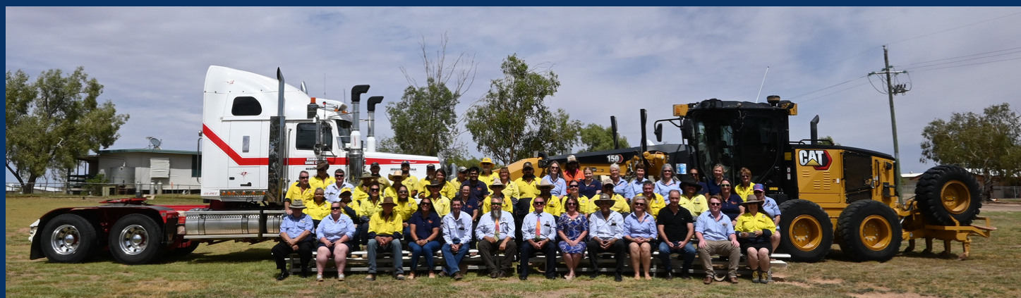
2022 Diamantina Shire Council team with the new Western Star Prime Mover and CAT 150 grader