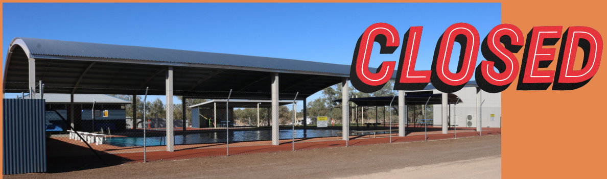
Birdsville State School Pool

Unfortunately, the cleaning robot has malfunctioned and has been sent away for repairs. Bedourie Pool is CLOSED until further notice. Council apologises for any inconvenience.