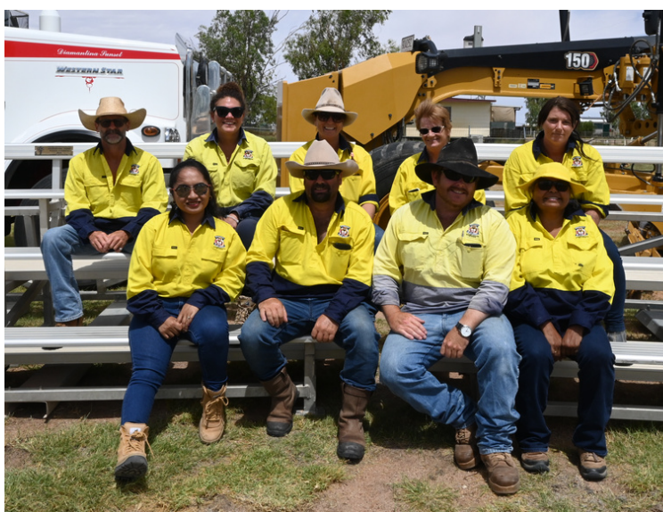
2022 Diamantina Shire Council - Town Services