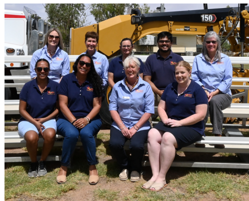
2022 Diamantina Shire Council - Tourism Team