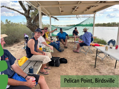
Pelican Point, Birdsville