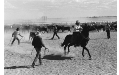
Bronco branding at the Great Australian Cattle Drive - Birdsville Racecourse, Queensland, May 2002.

S A E E M C C A V O F Q R D X T V L W T U A G V T V J C P I B S Q G D V T G O M B O C I L U I V V R H C C X F R X D R V V N T I A E H G M E O A S L P R G N O M V E M D G N A O X U G L R O P E R N M L C F K X N E E W O X R A R H P O P L S D V S M P U R O M A I F S E C B O I B Y B N K I O N D V T O O U R F U H H D O U B L E S N R X W W L F R D A A O V X S E G S R X Z V N O C N I T P E C A R U I P M Q U C V L M K Q V T I C W U M D R S T O L S K P