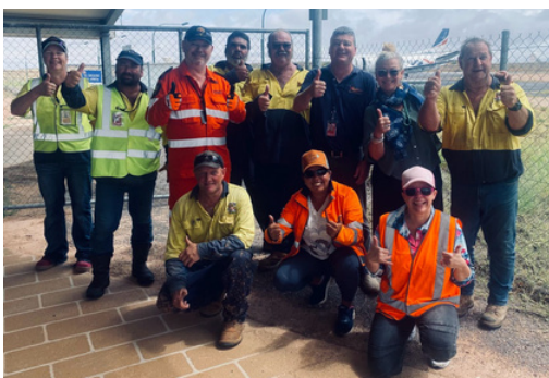
Thanks to the collaborative team in Bedourie