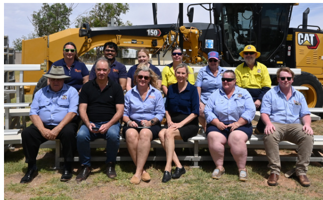
2022 Diamantina Shire Council - Bedourie Administration Team