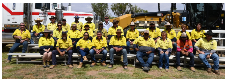
2022 Diamantina Shire Council - Infrastructure Team