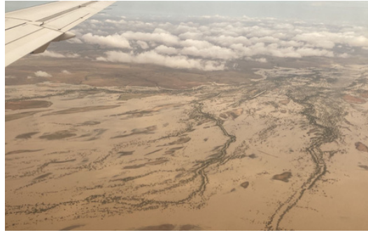
Flood water observed onboard REX Airlines