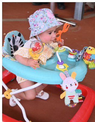
Enjoying the Christmas celebrations