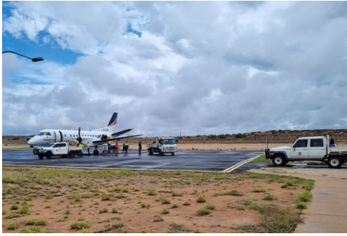
Unloading in Bedourie